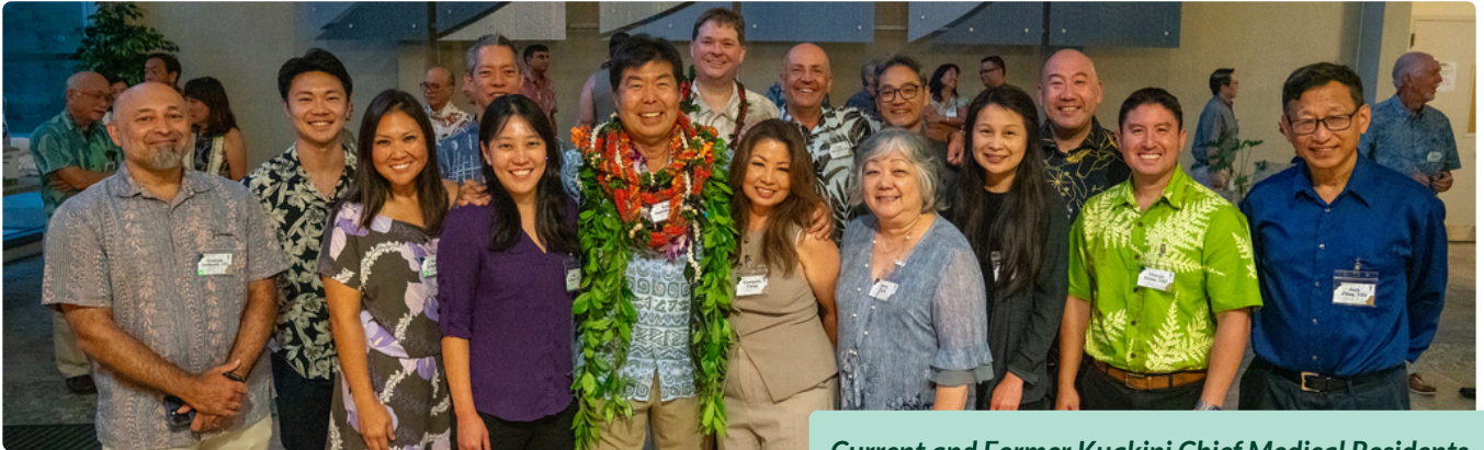
Current and Former Kuakini Chief Medical Residents

Greetings from the UH Department of Medicine!